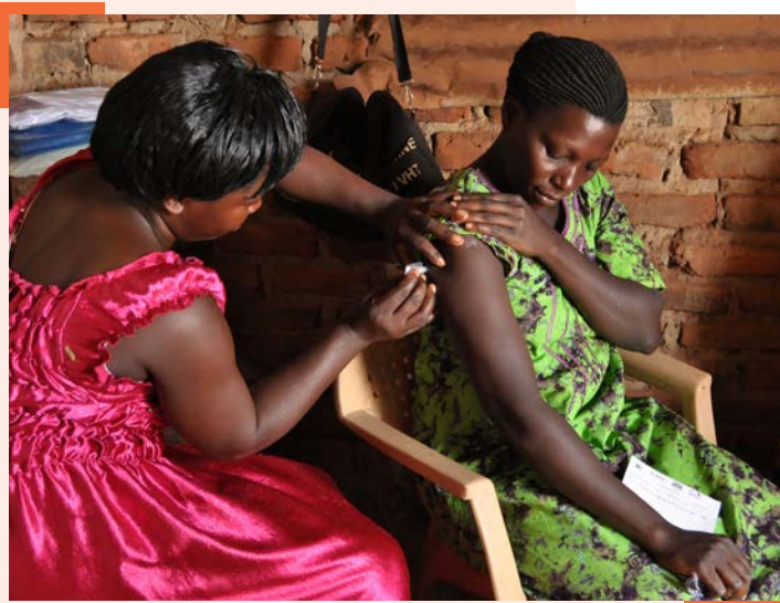
Global health photos courtesy of Photoshare by K4Health™

Implementation to Impact – Improving Health at Home and Abroad